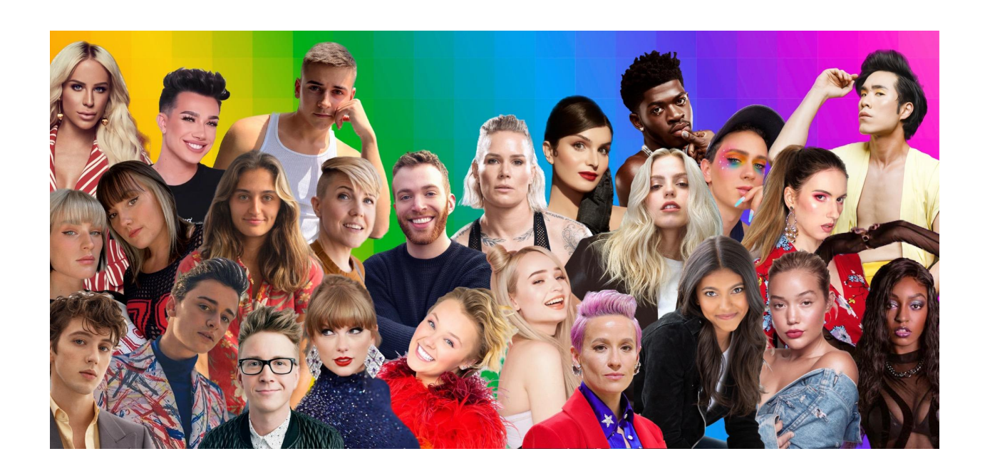
Figure 2 Collage of Queer Influencers and Celebrities Mentioned by Participants<sup>4</sup>

Queer content has an impact on individuals, communities, and the perception of popular stars or media. Social media can be extremely empowering for queer people. Participant 2 shared, "I'm following so many queer people on TikTok, and anytime I get on TikTok it feels like just a barrage of queerness...Just being able to see that representation feels very much like I'm at home. I feel safe. I feel warm." Participant 8 articulated that, for queer users, something as simple as putting a rainbow emoji in one's social media bio is like an "announcement to the world." Participants 5 and 13 agreed that coming out on social media quickly and impressively disseminates the information to one's social network and is like a permanent digital tattoo. Interestingly, participants 8 and 13 are single, so they cannot come out by posting a couple's